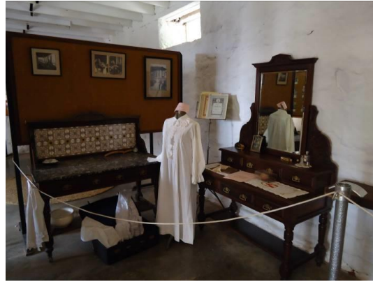
Figure 1 – Some of the items which have recently been donated to the Rhodes Historical Exhibition, Nyanga

Signage has been replaced and a lot of repairs and maintenance have been undertaken, including the cleaning up and repainting of the little ‘shop’ opposite the Exhibition, we have just heard that it has been opened already and has a number of interesting items for the visitor to purchase.