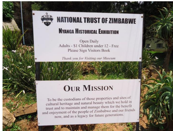
Figure 2 Signs have been spruced up outside the Exhibition

Signage has been replaced and a lot of repairs and maintenance have been undertaken, including the cleaning up and repainting of the little ‘shop’ opposite the Exhibition, we have just heard that it has been opened already and has a number of interesting items for the visitor to purchase.