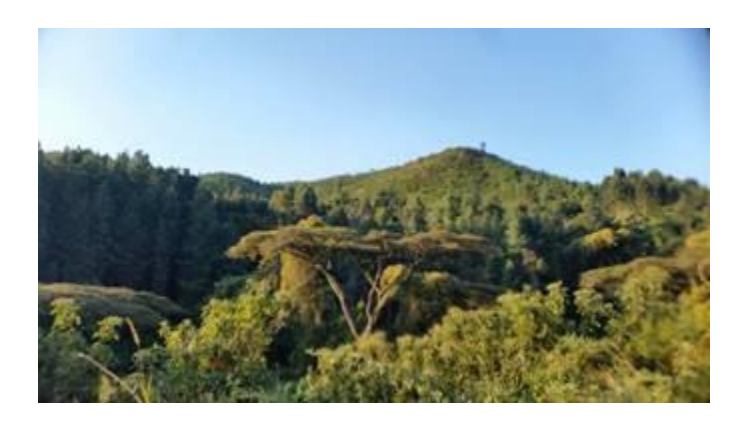
Some of the views from La Rochelle and of the interior.