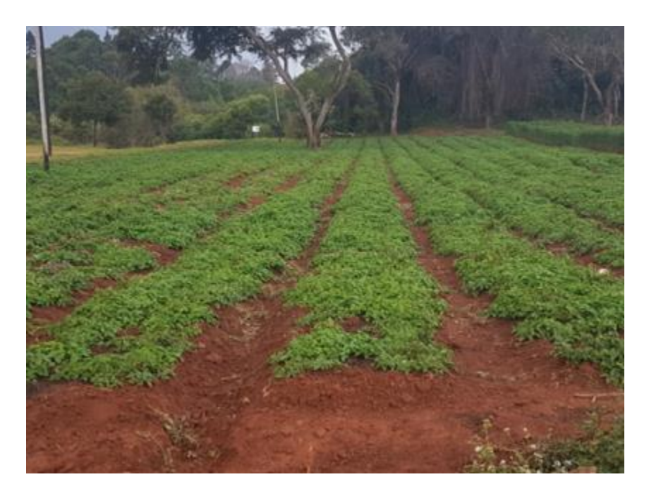
Lemon Balmb (above) grows well in the rainy season.