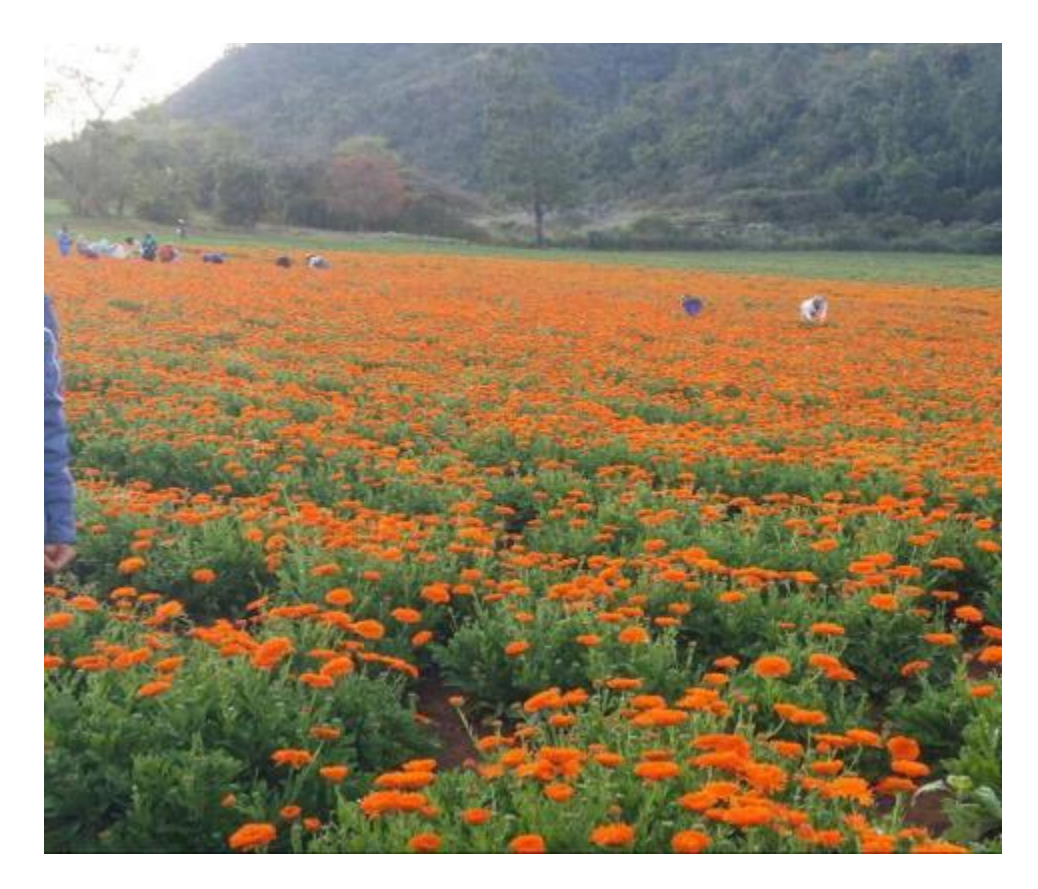
Calendula (above) has good anti-inflammatory and anti-bacterial properties.