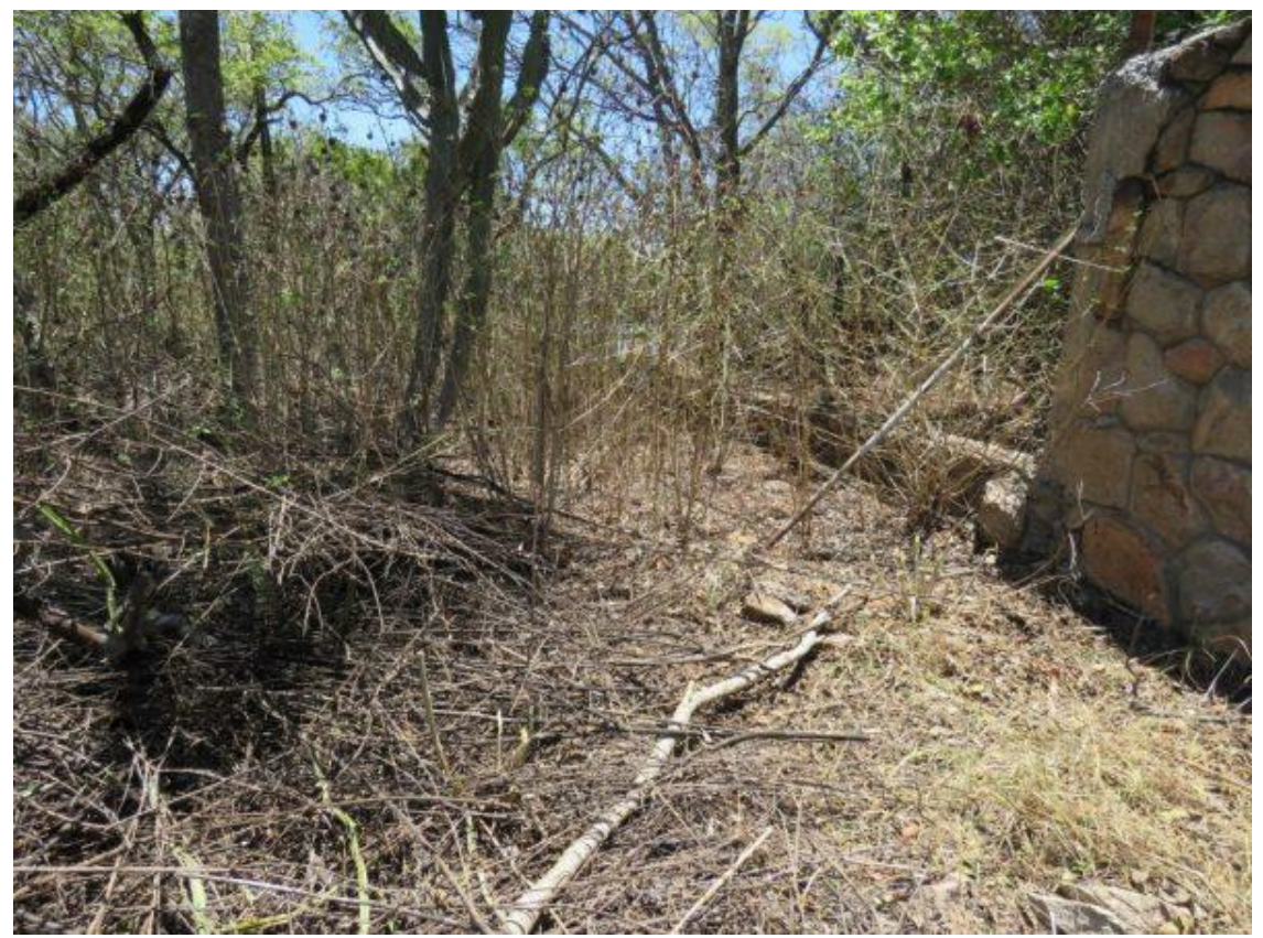
• Both our FACEBOOK page and website are quite active with up to date news and photographs, and we encourage those of you with FACEBOOK to like us.

https://www.facebook.com/pages/National-Trust-of-Zimbabwe/340040082696277?ref=hl