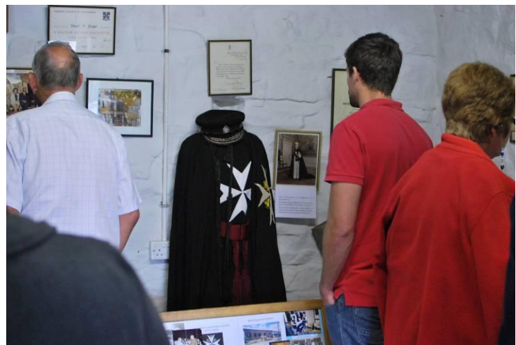
Figure 8 Visitors viewing the Don Grainger Room