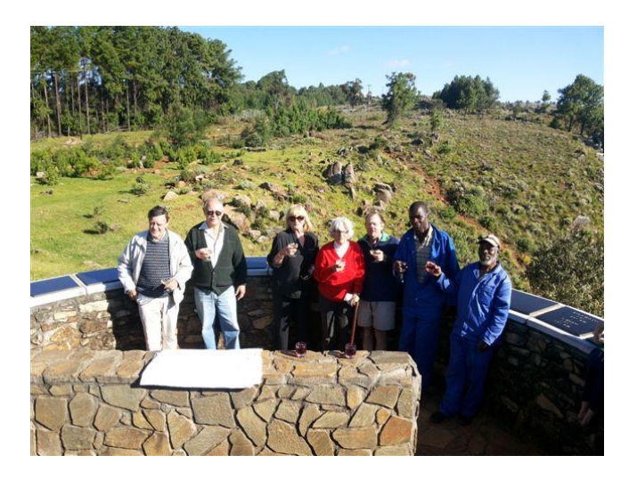
Figure 9 Council members and staff at Worlds View

3. INTERNATIONAL EVENTS - Czech National Trust Launches in London