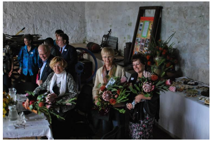
Figure 6 VIPs with bouquets of proteas