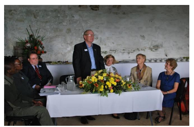
Figure 2 Address by Ambassador Neuhaus of Australia