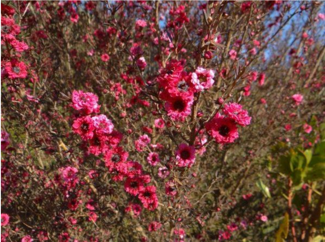
One of the very spectacular Tea Tree bushes thriving at the World's View site