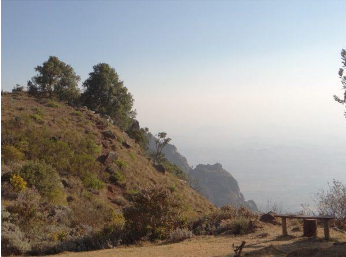
A very hazy view at this time of the year over Nyanga village from World's View