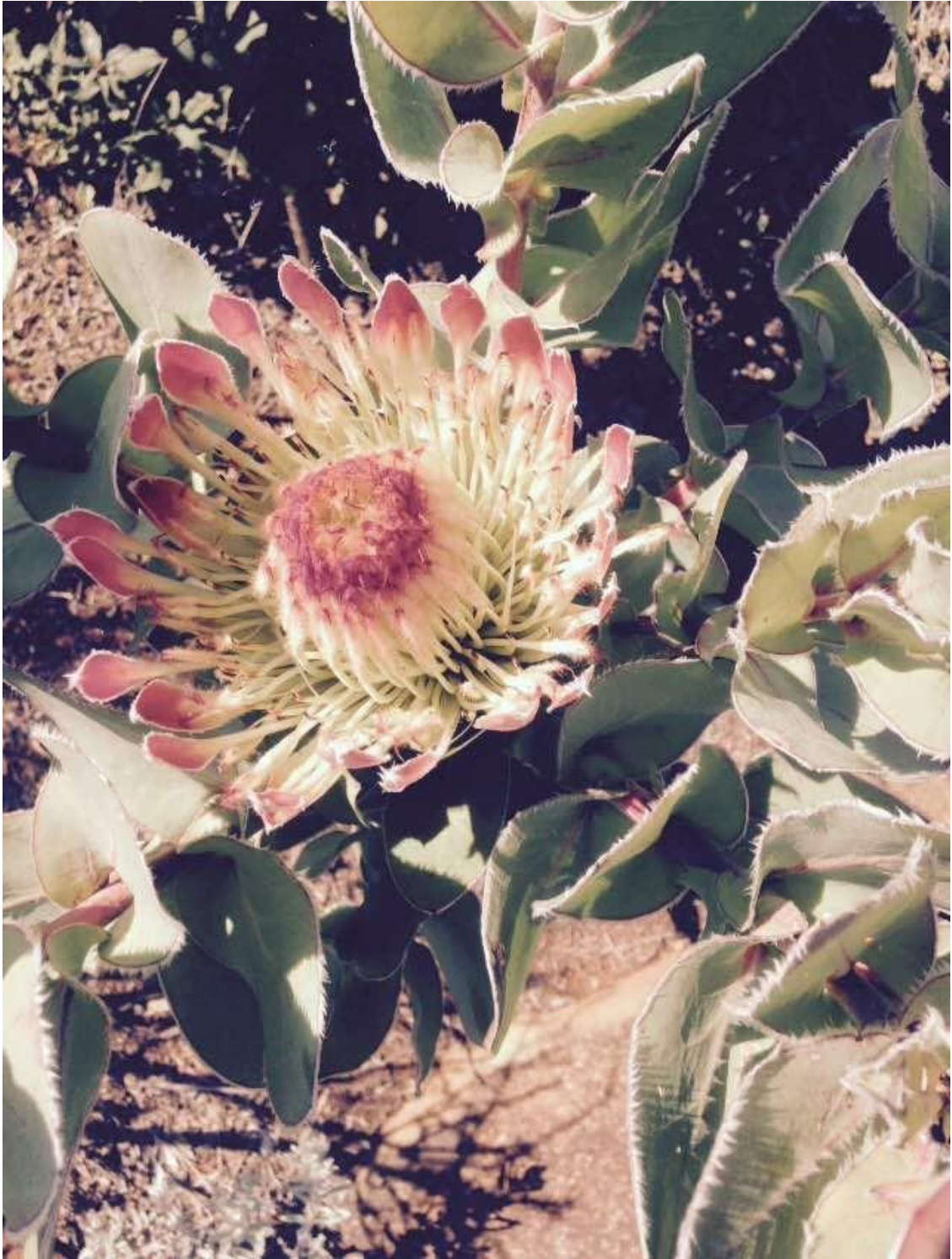
Stunning! First bloom of the Protea Eximia !