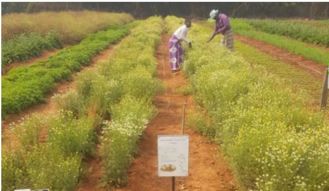
Organic Chamomile (above) grows well in winter.