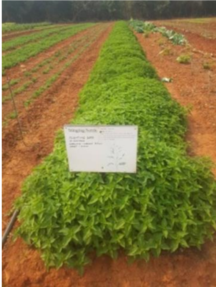
Stinging nettle, above, grows well in sunshine.