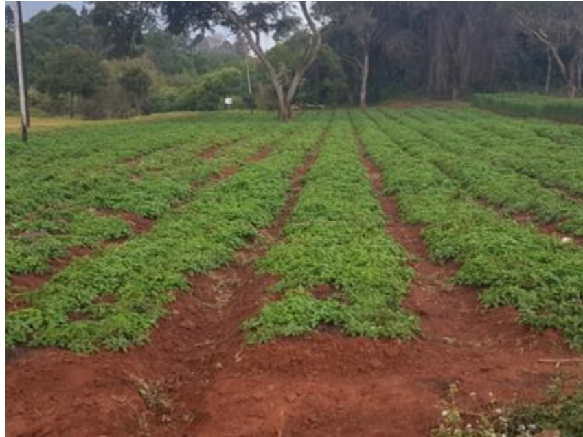
Lemon Balm (above) grows well in the rainy season.