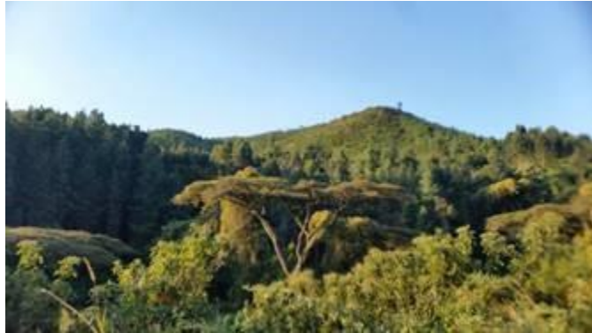
Some of the views from La Rochelle and of the interior.