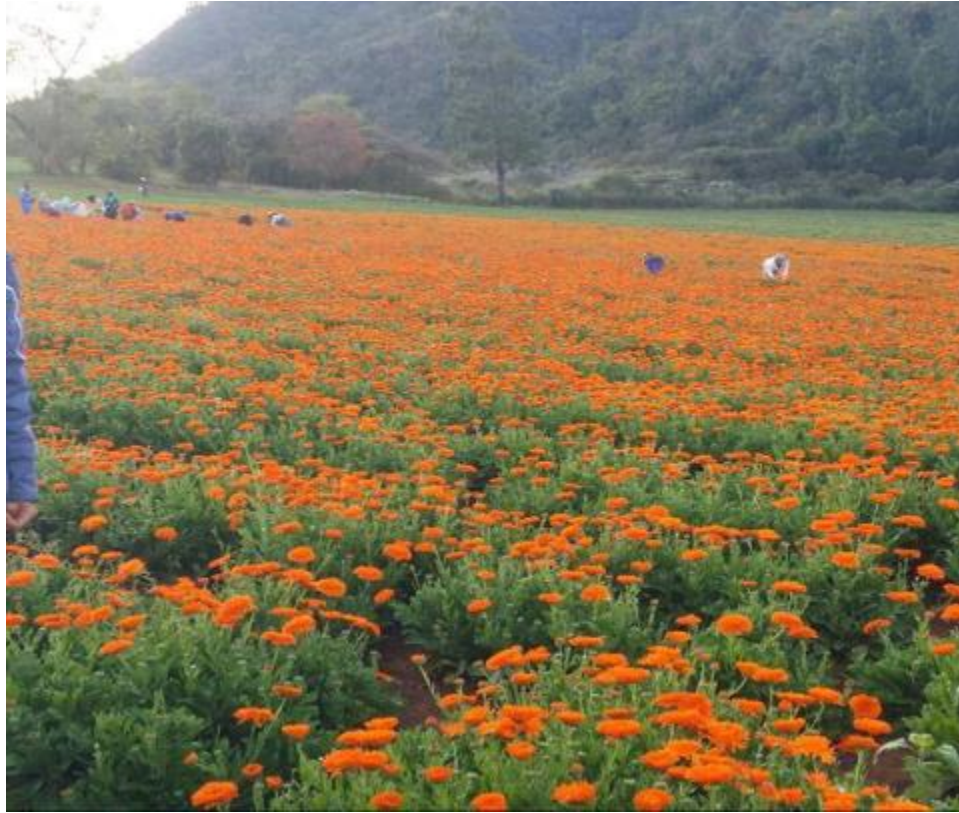
Calendula (above) has good anti-inflammatory and anti-bacterial properties.