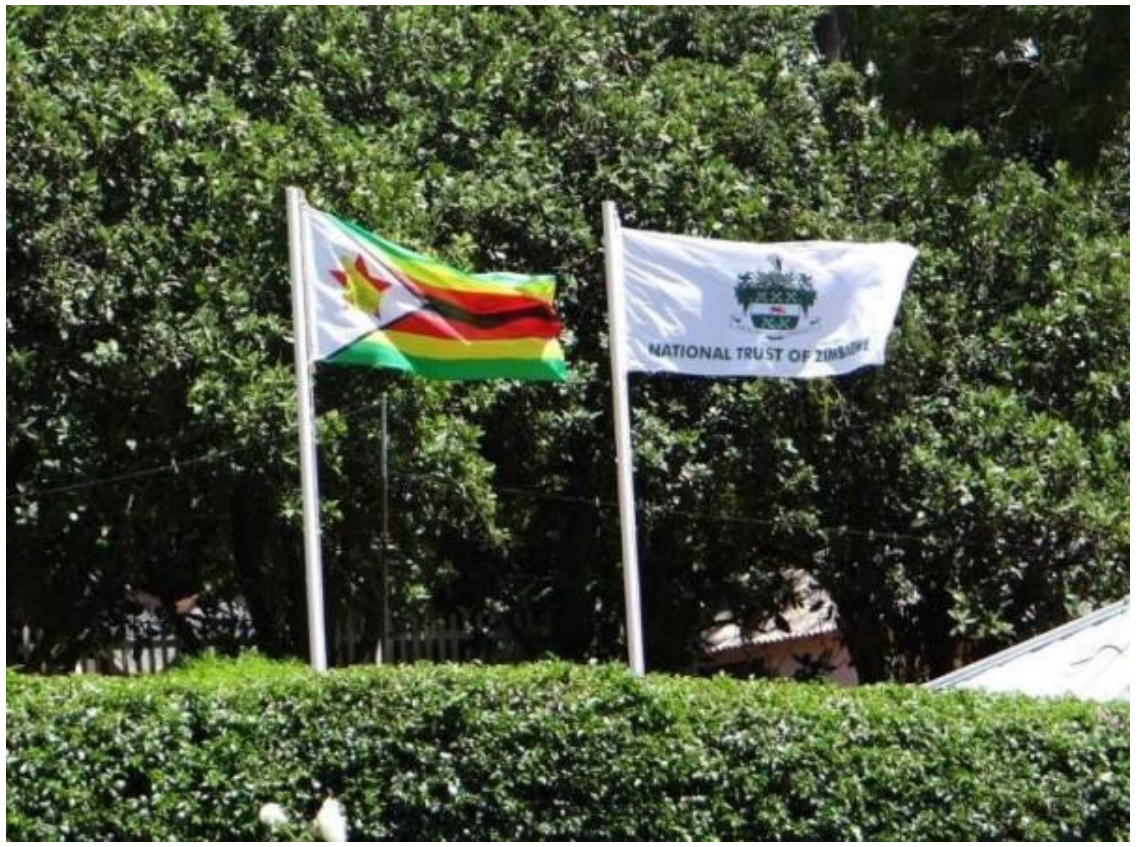
Proudly NATIONAL TRUST of ZIMBABWE!