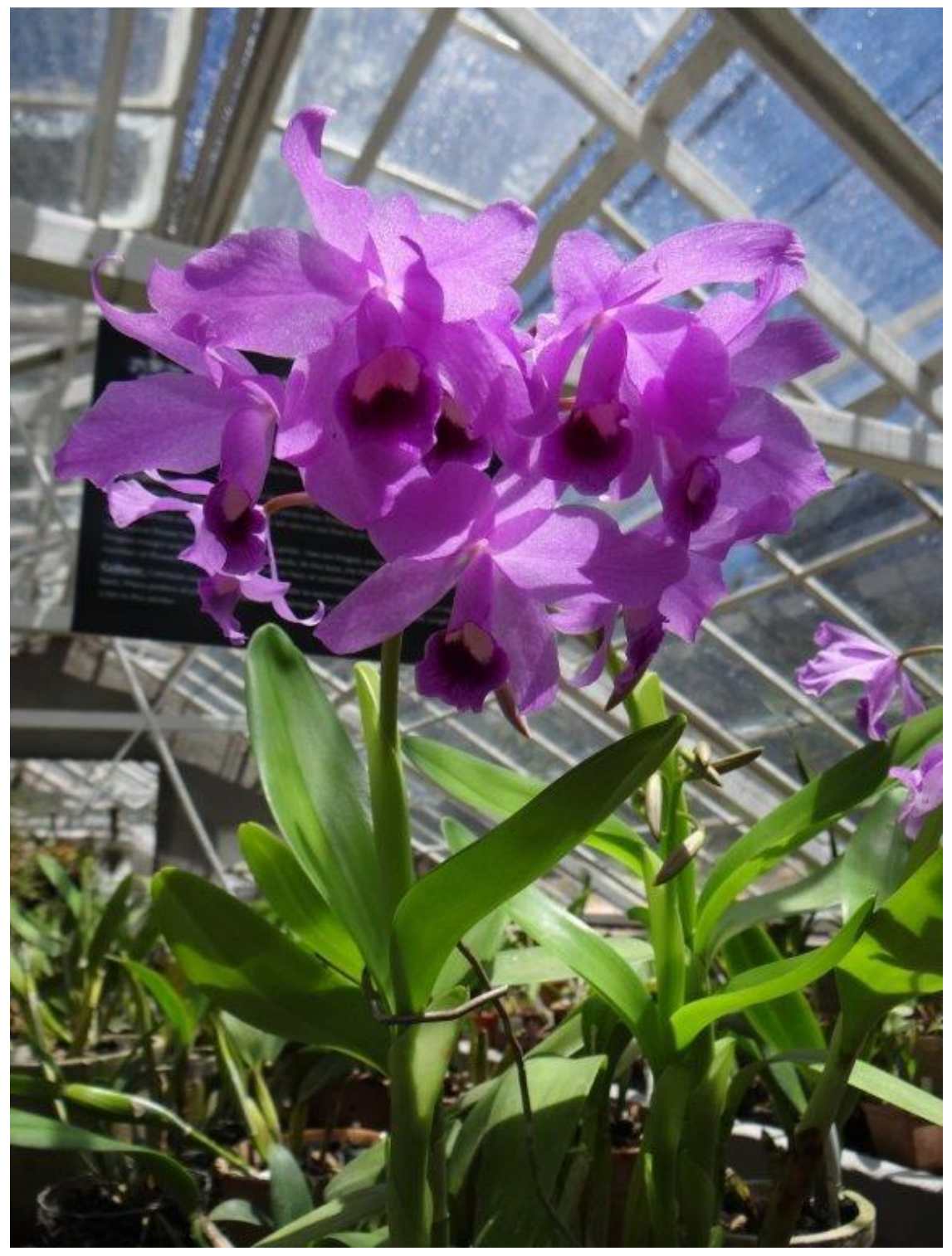
One of the beautiful dendrobiums in full bloom in the new shade houses