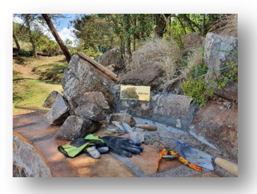
Work in progress