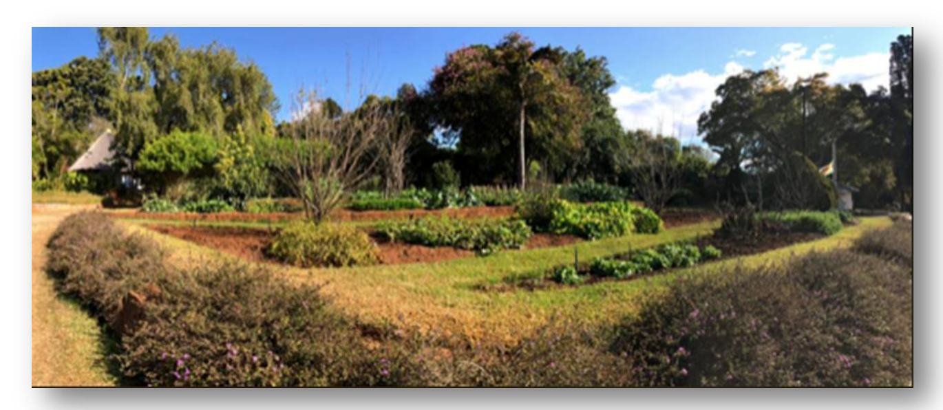
The view of the organic vegetable garden from the front of the hotel

The gardens and entrance are looking in excellent shape right now thanks to Kevin's supervision and over the last year or so a number of indigenous trees were planted at La Rochelle.