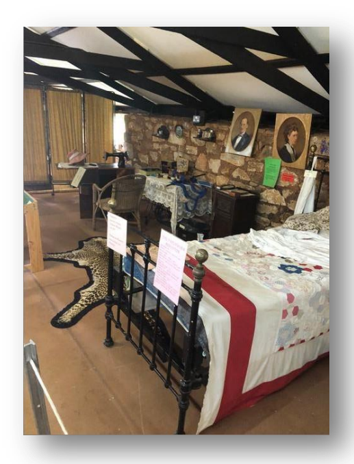
Exhibit on the upper floor

Included in our projects for the future are a 50-seater video/lecture room to accommodate those restless school pupils awaiting their turn to be shown round the Museum. This facility will take a lot of pressure off our curator, and could also be used for public lectures of interest to the local community.