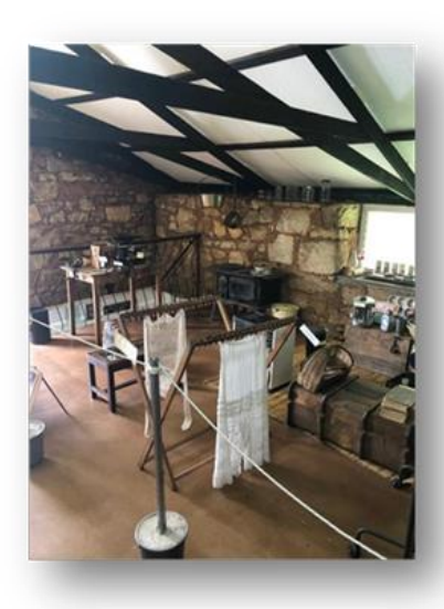
Exhibit on the upper floor

The elements - and baboons - take their toll on our ageing structures. Roof-leaks appeared during the recent very wet season in our upstairs gallery and in the Grainger reading room; and a leaping baboon (bearing in mind that our Museum is situated within a game-park) crashed through the veranda roof before making a startled departure. The outside wooden stairway, leading to one end of our loft display area, had rotted to the point where it was no longer safe and, again, we are grateful both for the supply of wooden steps by the Logans and to Marshall for so painstakingly installing them, as he has also done with wooden railings alongside the display shed. In addition he takes care of the strip of lawn and flower beds at the front of the building. Clearly, it is necessary for the Museum to have its own watersource, rather than constantly drawing from the hotel, and plans are in hand to pipe water down from a furrow higher up the slope.