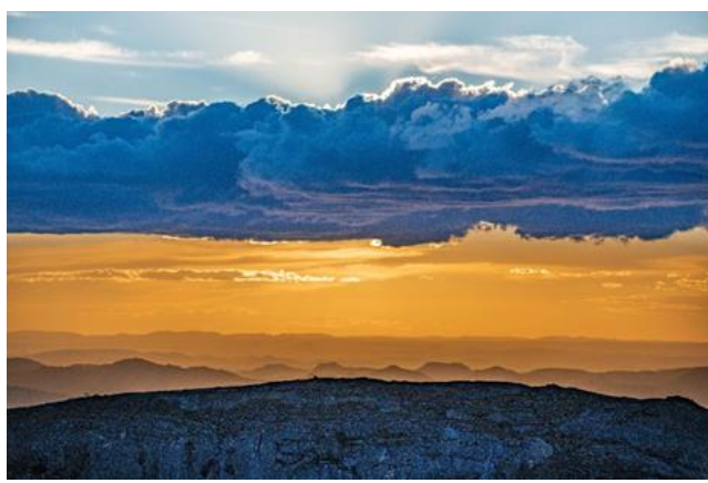
Early morning dew on spider's web at World's View Sunset over the valley below the World's View escarpment

Once again, we thank all our visitors for their continued support and generosity at the View. Even at the height of the COVID-19 pandemic, we kept the View site open for those willing to tackle the harsh road 'up the mountain' to take in the fresh mountain air, enjoy the magnificent scenery, flora and birdlife. Most returning visitors now bring their picnic baskets and cooler boxes and make a real day of it, some stay well into the evening to witness the magnificent sunsets from the various vantage points and toposcope.