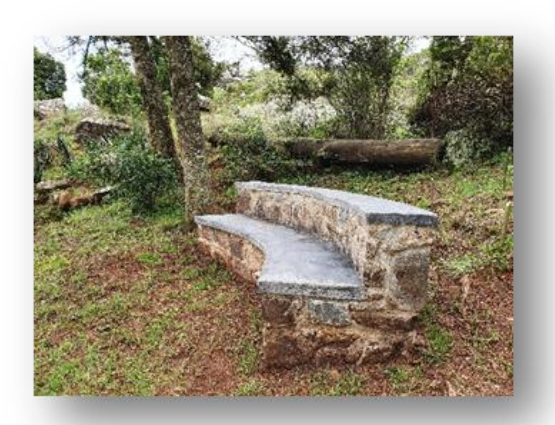
One of the new benches

Just below the toposcope, an old staircase was discovered after removing some ground cover overgrowth. We tagged on another bench which now provides a pleasant shady spot for visitors to sit. It should take about a year for the grass and shrubs to established themselves, providing that the oncoming winter does not take its toll!