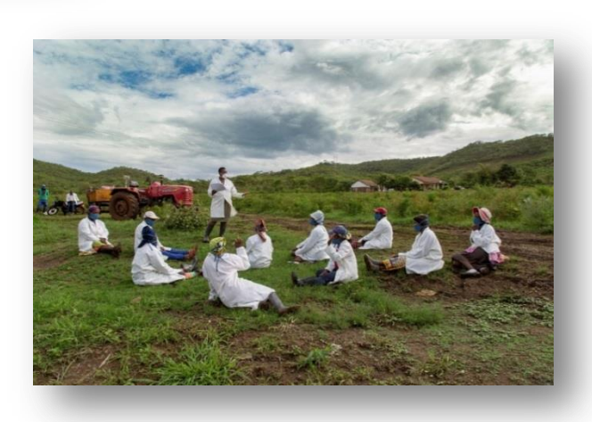
COVID-19 Training in Awareness and Prevention

Of the 49,000 confirmed cases in Zimbabwe, only 1 out of 342 LRO workers reported to have contracted COVID-19 (January to July 2021): a strong indication that LRO has been quite successful in curbing the spread of the