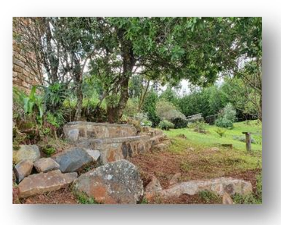
New bench terracing not yet complete