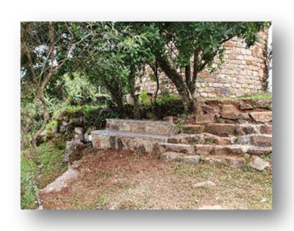
The discovered' staircase

Just below the toposcope, an old staircase was discovered after removing some ground cover overgrowth. We tagged on another bench which now provides a pleasant shady spot for visitors to sit. It should take about a year for the grass and shrubs to established themselves, providing that the oncoming winter does not take its toll!