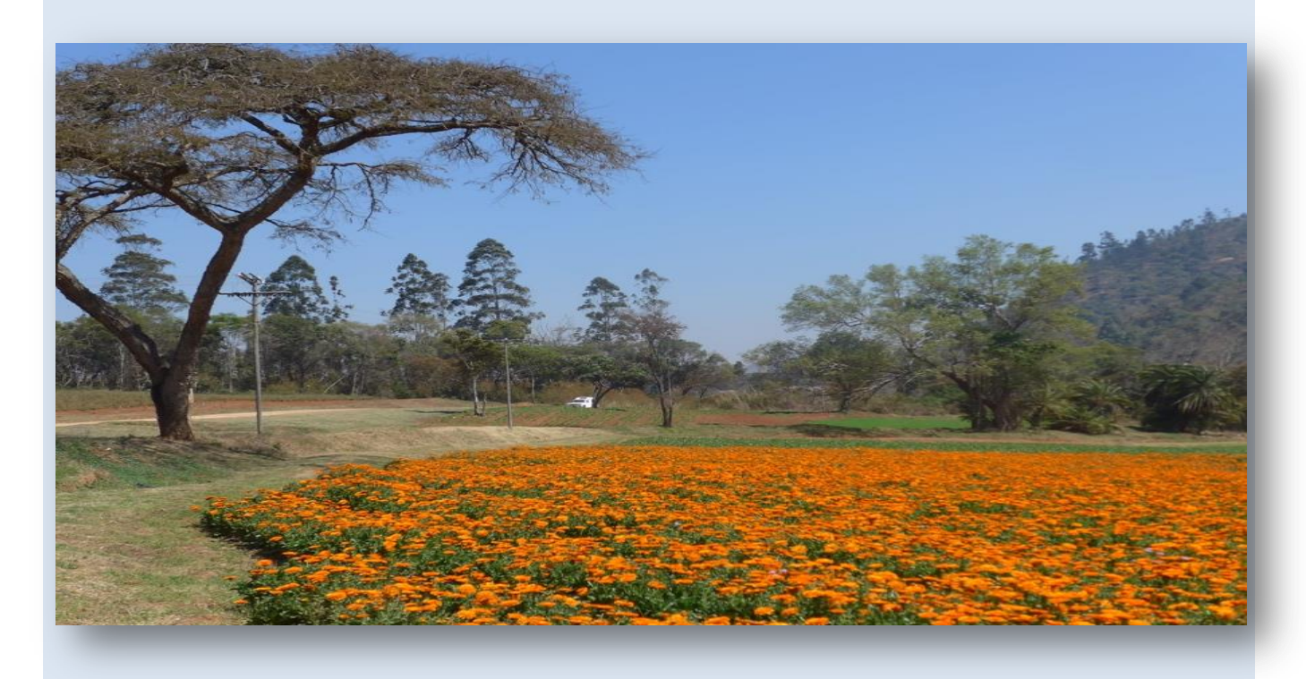
Organic Calendula being grown by Organic Africa at La Rochelle