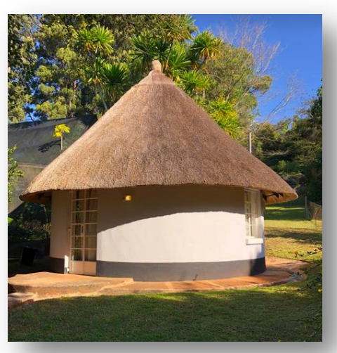
Inside the newly renovated Nigel's Cottage and Front view of Nigel's Cottage